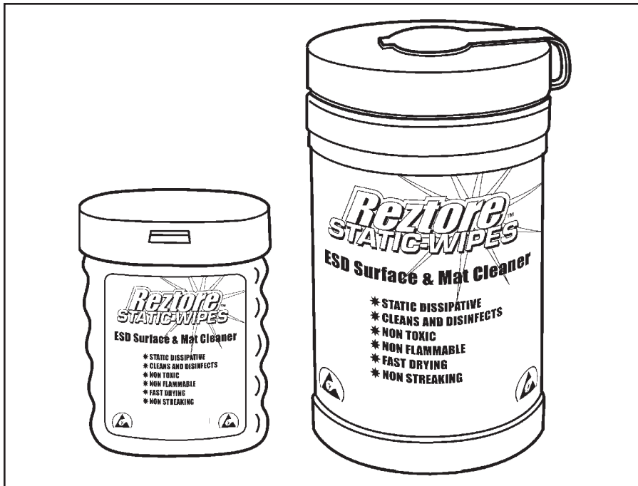
Figure 1. Reztore™ Static-Wipes: 60 Wipes in an Anti-Static Canister 160 Wipes in an Anti-Static Canister