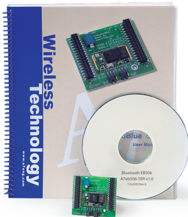
Bluetooth Add-on Kit

A7 Engineering is an engineering and design firm specializing in connectivity and interoperability solutions for the embedded marketplace. A7 provides services ranging from engineering assistance to custom features and complete designs. A7's EmbeddedBlue line of products provides industry leading simplicity in an affordable, standardized, and easy to integrate wireless solution across 8, 16, and 32 bit systems.