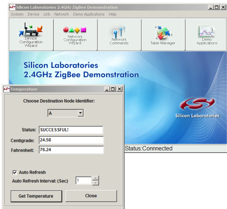
Figure 2. 2.4 GHz ZigBee Demonstration Software

Detailed instructions are in document "AN240: 2.4 GHz ZigBee Demonstration Software User's Guide", included with this kit.